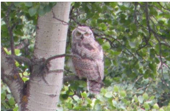
Great-horned owl spotted on EALT's Ministik Property

Thanks to a generous EcoGift donor and the hard work of the EALT staff, we have acquired a beautiful quarter section of land adjacent to Ministik Bird Sanctuary, an International Bird Area, thus expanding this "island" of protection. The property is typical knob and kettle topography, covered in lush deciduous forests and sedge-filled wetlands, and provides habitat for many songbirds, waterfowl, ungulates and other wildlife. During our visit there this summer we were lucky enough to see both a moose and a young Great-horned Owl.