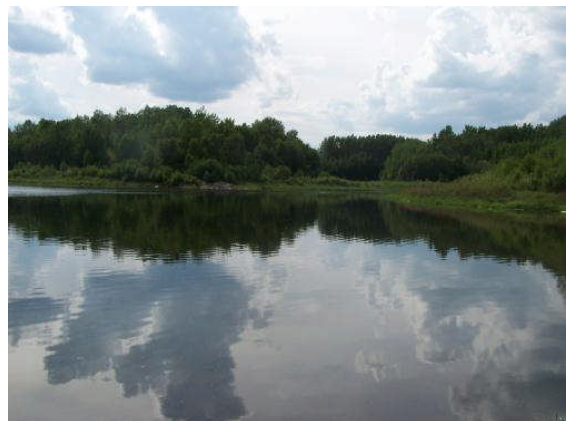
A beautiful day at our Glory Hills Property