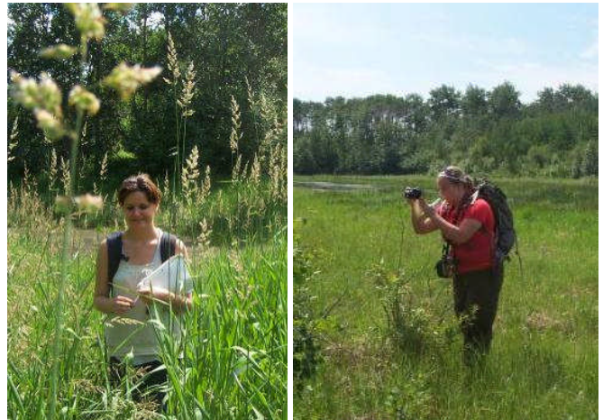
Volunteers in tall grass and taking photos records