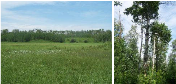
One of the many wetlands, and old growth Aspen at Ministik

Thanks to a generous EcoGift donor and the hard work of the EALT staff, we have acquired a beautiful quarter section of land adjacent to Ministik Bird Sanctuary, an International Bird Area, thus expanding this "island" of protection. The property is typical knob and kettle topography, covered in lush deciduous forests and sedge-filled wetlands, and provides habitat for many songbirds, waterfowl, ungulates and other wildlife. During our visit there this summer we were lucky enough to see both a moose and a young Great-horned Owl.