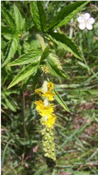
Agrimony flower growing in the sunshine at Glory Hills

We are now well into the summer field season at EALT. Much of our time has been spent at the Glory Hills Property, which we acquired this past winter.