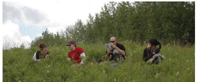
Volunteers having lunch and identifying plants

Penn West Donates for Volunteer Materials