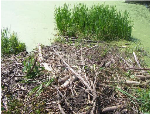
An active beaver lodge at Glory Hills