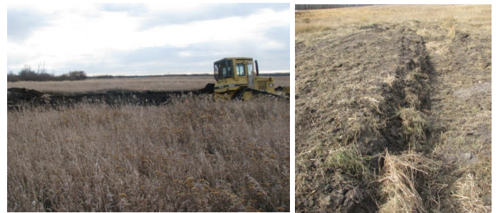
Building a dirt plug on a drained wetland on the Golden Ranches; and a completed plug

Last fall, Ducks Unlimited Canada built plugs in drained wetlands on EALT lands, with the intent that they fill up again naturally. With the high amount of snow this winter, we hope these newly restored wetlands will start to function and create valuable wildlife habitat.