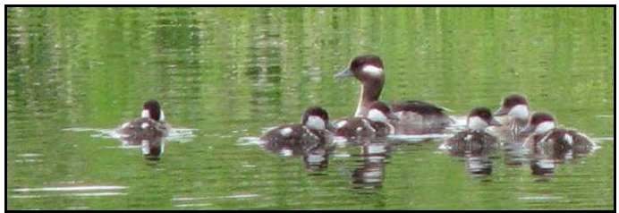
Bufflehead with eight ducklings

EALT has entered into an agreement with DUC on the 3 quarter sections we secured at Golden Ranches earlier this year. The purpose of this project is to maintain and improve restored and retained wetlands as habitat for wildlife and waterfowl.