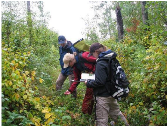
Volunteers performing flora surveys at Hicks

It was a beautiful fall in the Edmonton area and EALT took full advantage of the pleasant weather. The last visit of the summer to the Hicks property took place in September and despite the foggy, wet weather was exceedingly enjoyable for all staff and volunteers involved. Several preliminary assessments were performed by staff and volunteers at potential properties. These visits took place, for the most part, on sunny days and it is always an adventure to explore a new property. For more photographs of our field activities see our facebook page!